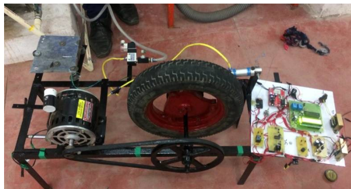
Fig2Image of the setup

If the solenoid valve is activated by the control unit compressed air from the compressor at a pressure of 5 bar passes to the Single Acting Pneumatic Cylinder and the piston in the cylinder will move by this compressed air. If the piston moves forward, then the braking system will be activated. The braking system is used to brake the wheel suddenly or gradually due to the movement of the piston and the braking speed is varied by adjusting the flow control valve. The solenoid valve is also connected to another single acting piston arrangement, which is used to absorb the shock in the bumper there by reducing the impact in the case of an accident. Fig.2 shows the image of the experimental setup of the system.